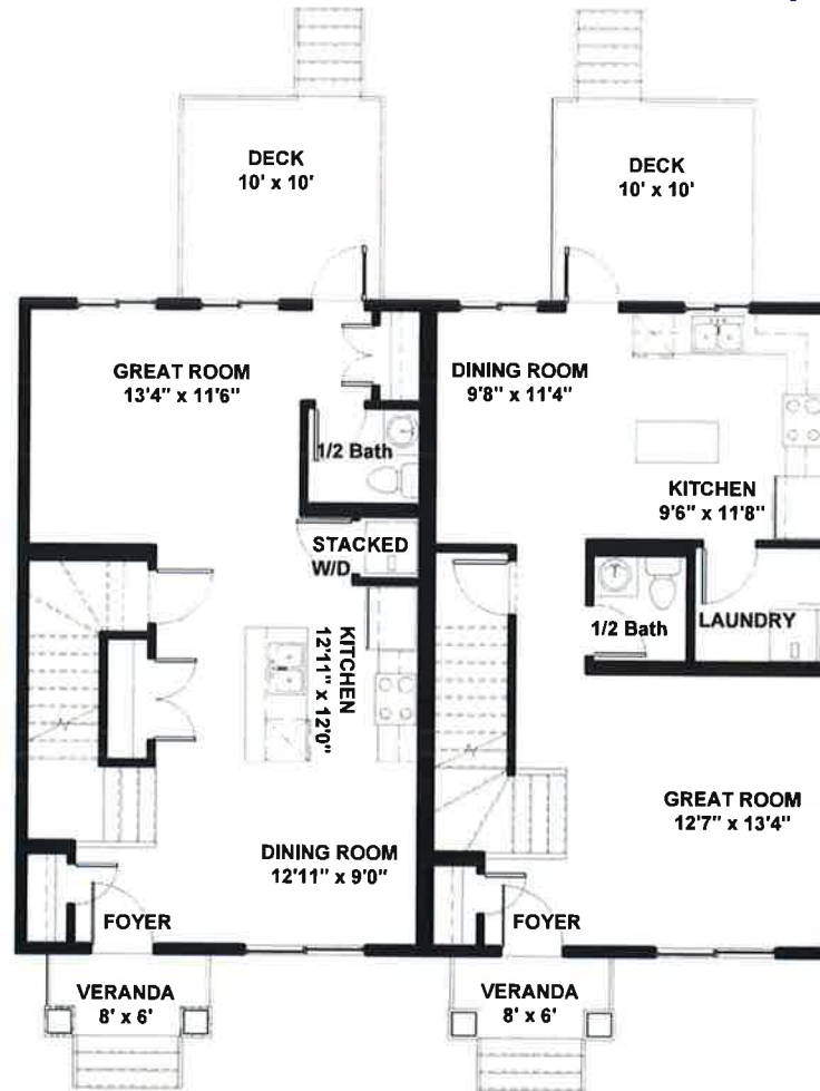
MAIN FLOOR 640 sq. ft. #120